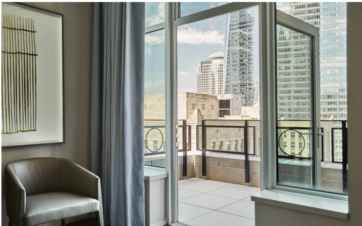
Four Seasons New York Downtown.

Further downtown, a south- or west-facing room at the Four Seasons Hotel New York Downtown will give you the best views of One World Trade Center and the Oculus.