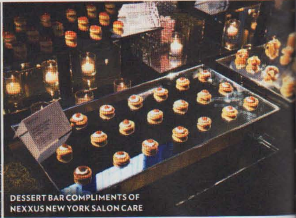
DESSERT BAR COMPLIMENTS OF NEXXUS NEW YORK SALON CARE