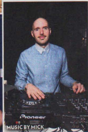
MUSIC BY MICK