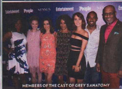
MEMBERS OF THE CAST OF GREY'S ANATOMY