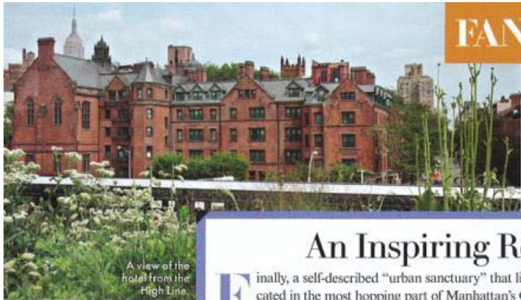
A view of the hotel from the High Line.