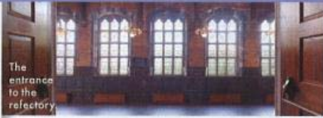
The entrance to the refectory.