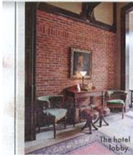
The hotel lobby.