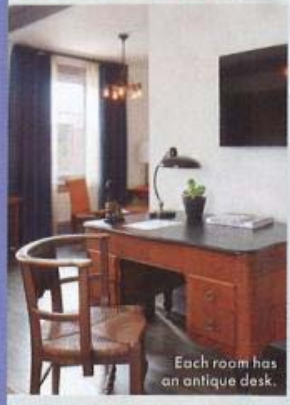
Each room has an antique desk.